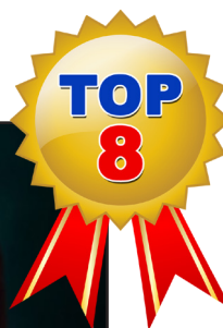
Krystelle Pearl K. Boac Psychometrician Licensure Examination (August 2016)